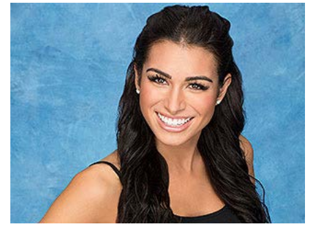
VIDEO: Ashley I.'s in Tears on The Bachelor's 'Emotional' 2-on-1 Date