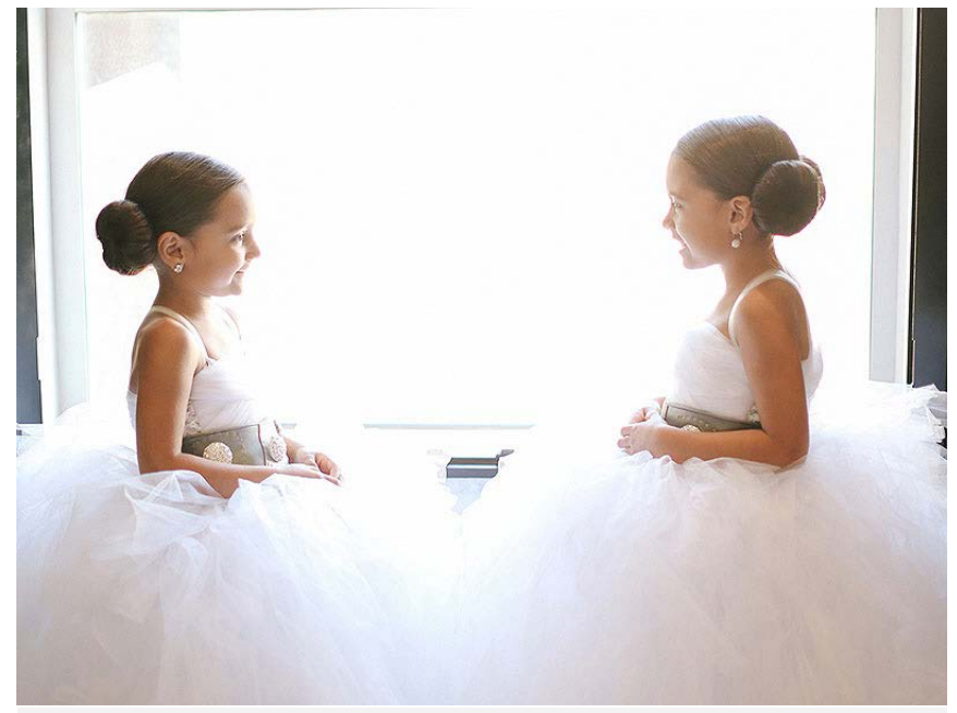
Flower girls sporting Princess Leia buns

"[They] escorted the bride and groom during their portrait session on the streets of downtown L.A., which was quite a fun experience," she told Green Wedding Shoes.