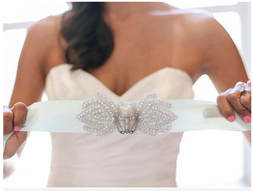
Landa's amazing blinged-out Stormtrooper belt

For the most part, she kept the details subtle – a blinged-out Stormtrooper belt here, a flower girl in Leia buns there – but she couldn't resist having two real-life Stormtroopers preside over the entire affair.